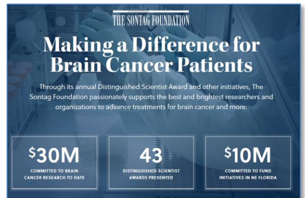
The Sontag Foundation's homepage

BTN began as a program of The Sontag Foundation 2 , a private foundation known for its strategic focus on brain cancer research and support for patients with brain cancer. Now an independent 501(c)(3), BTN has proven its efficacy through service to hundreds of patients and families across the United States. With funding