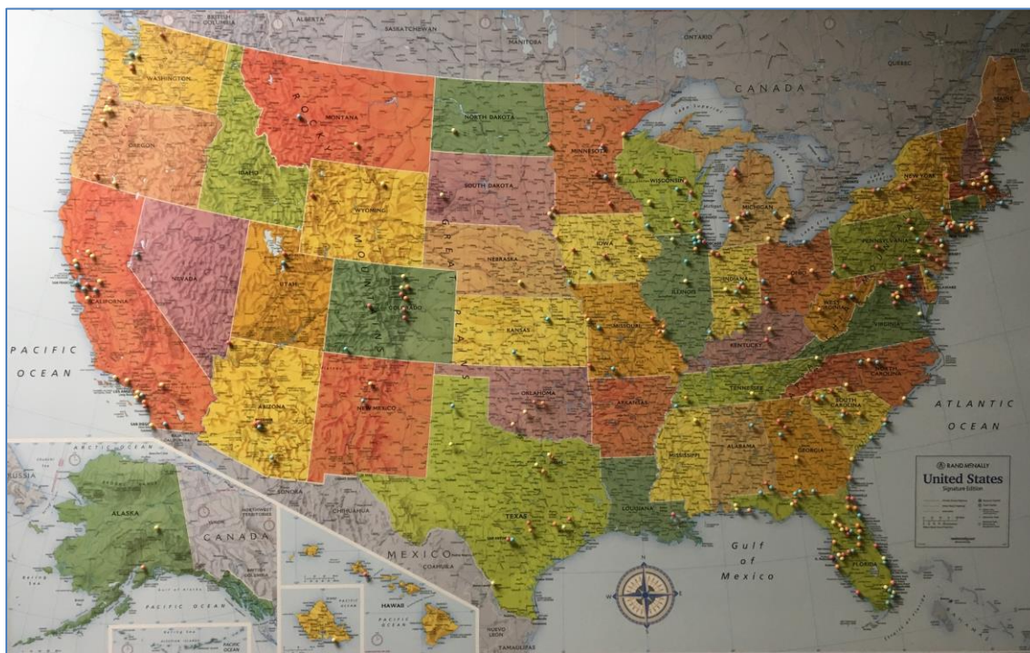
Wall map in BTN's offices showing location of patients served