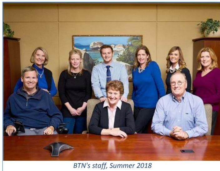
BTN's staff, Summer 2018

In less than four years, Brain Tumor Network has grown from a concept to a treasured resource valued by patients, respected by leaders in neuro-oncology and attractive to the growing staff of credentialed nurses and social workers who have chosen BTN over other noteworthy career options.